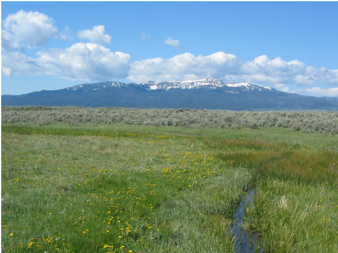
Tepee Creek looking South